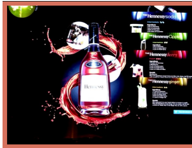
Stacked Content Orientation